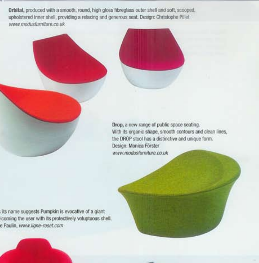
Orbital , produced with a smooth, round, high gloss fibreglass outer shell and soft, scooped, upholstered inner shell, providing a relaxing and generous seat. Design: Christophe Pillet www.modusfurniture.co.uk