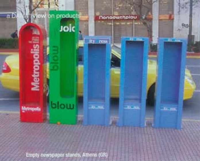
Empty newspaper stands, Athens (GR)