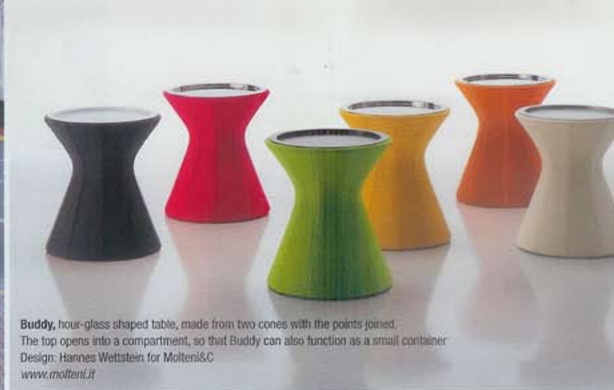
Buddy , hour-glass shaped table, made from two cones with the points joined. The top opens into a compartment, so that Buddy can also function as a small container. Design: Hannes Wettstein for Molteni&C www.molteni.it