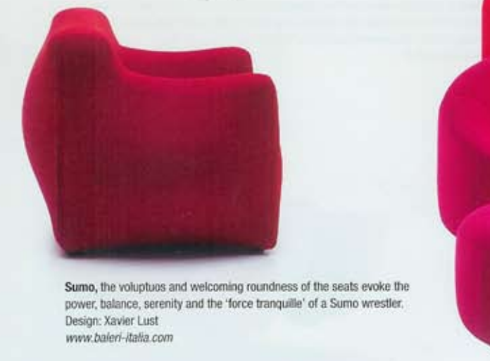
Sumo , the voluptuous and welcoming roundness of the seats evoke the power, balance, serenity and the 'force tranquille' of a Sumo wrestler. Design: Xavier Lust www.baieri-italia.com