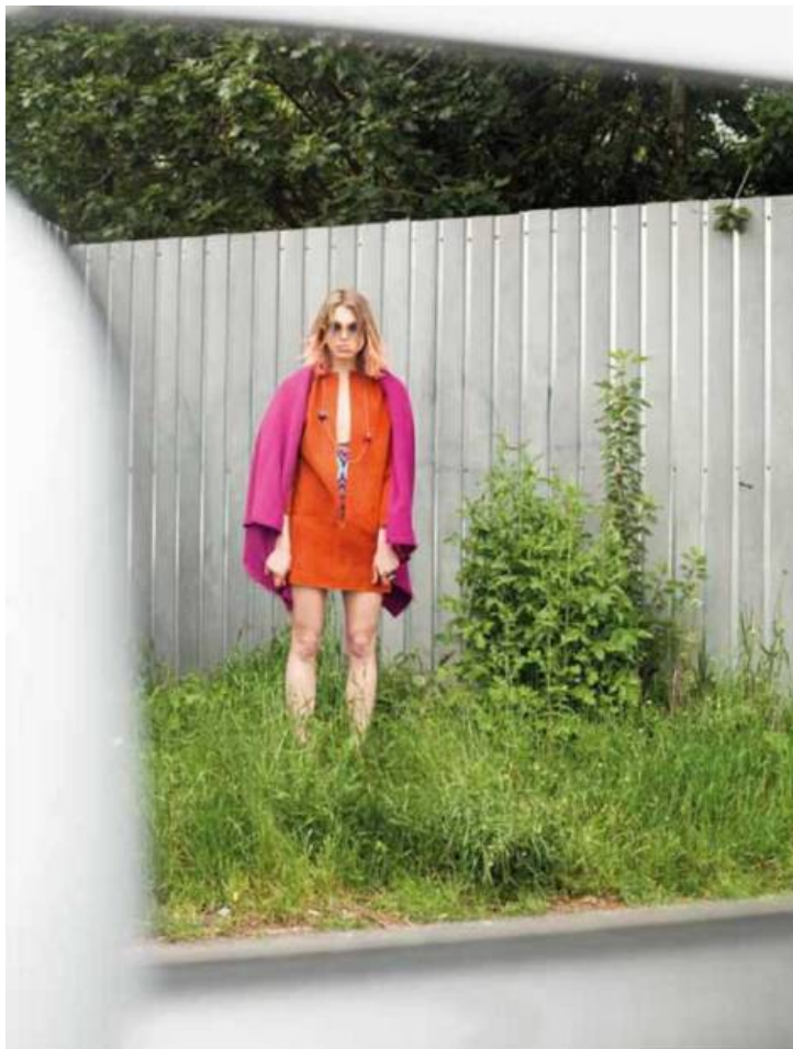
Lycra bathing suit URBAN OUTFITTERS, Suede caftan HERMÈS, Sunglasses URBAN OUTFITTERS, Necklace TAMAWA, Ring ACCESS, Sandals FILIPPA K, Vintage fleece MAKE-UP ARTIST'S OWN