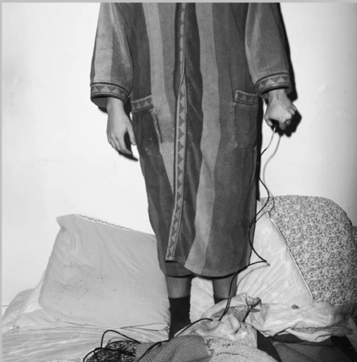
The grey album

Neighbourhood Smart move Life The writing on the wall Style The third man Music A shaded view Culture Stone cold + The photography special